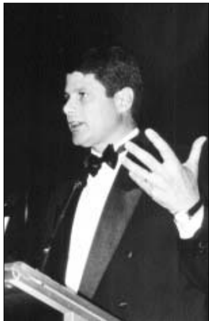
The Hon. Steve Bracks MP.