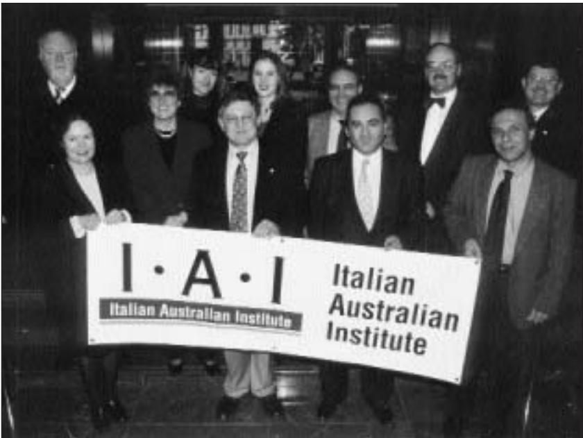
I.A.I. Directors and Conference Steering Committee.