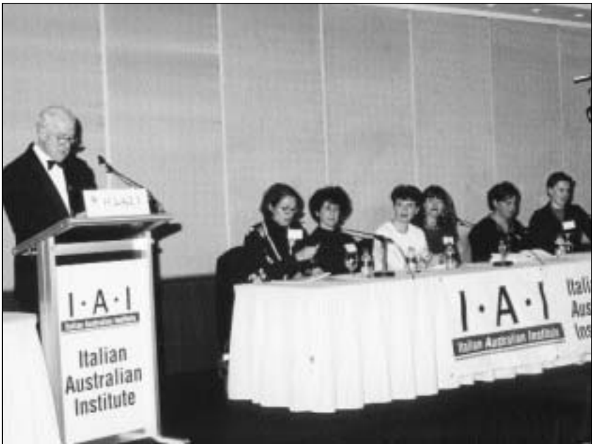
Panel: Exploring Identity and Community Through the Arts and Culture.