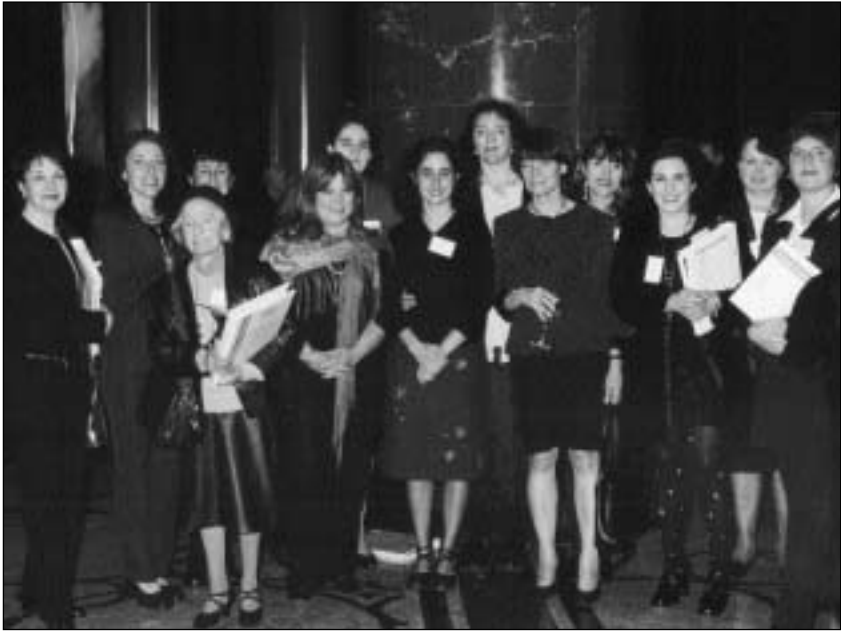
Women's issues took a prominent focus at the Conference.