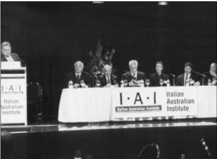
Panel: Global Reality